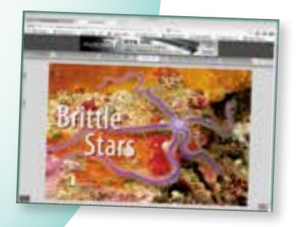
CORAL MAGAZINE Digital Edition