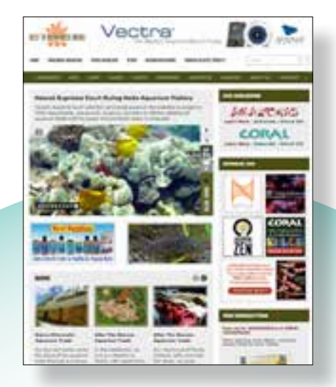
REEF2RAINFOREST.COM Dynamic Web Site