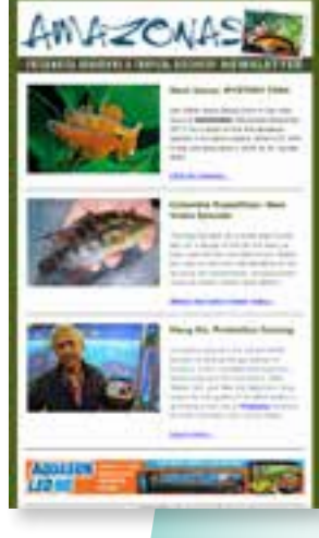
AMAZONAS MAGAZINE e-Newsletters