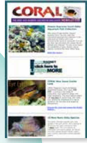
coral magazine e-Newsletters