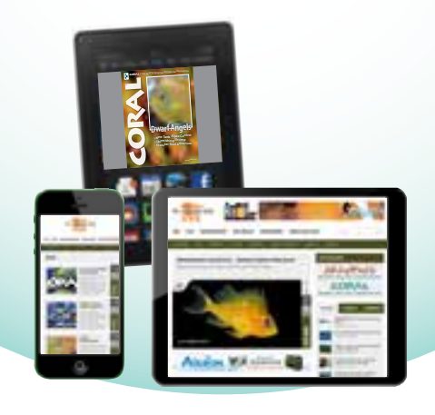
MOBILE MEDIA APPS IOS, Kindle, Android