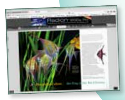
AMAZONAS MAGAZINE Digital Edition